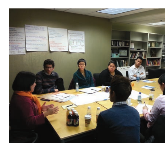
Youth Advisory Council members discuss student mobilization strategies at their annual retreat.